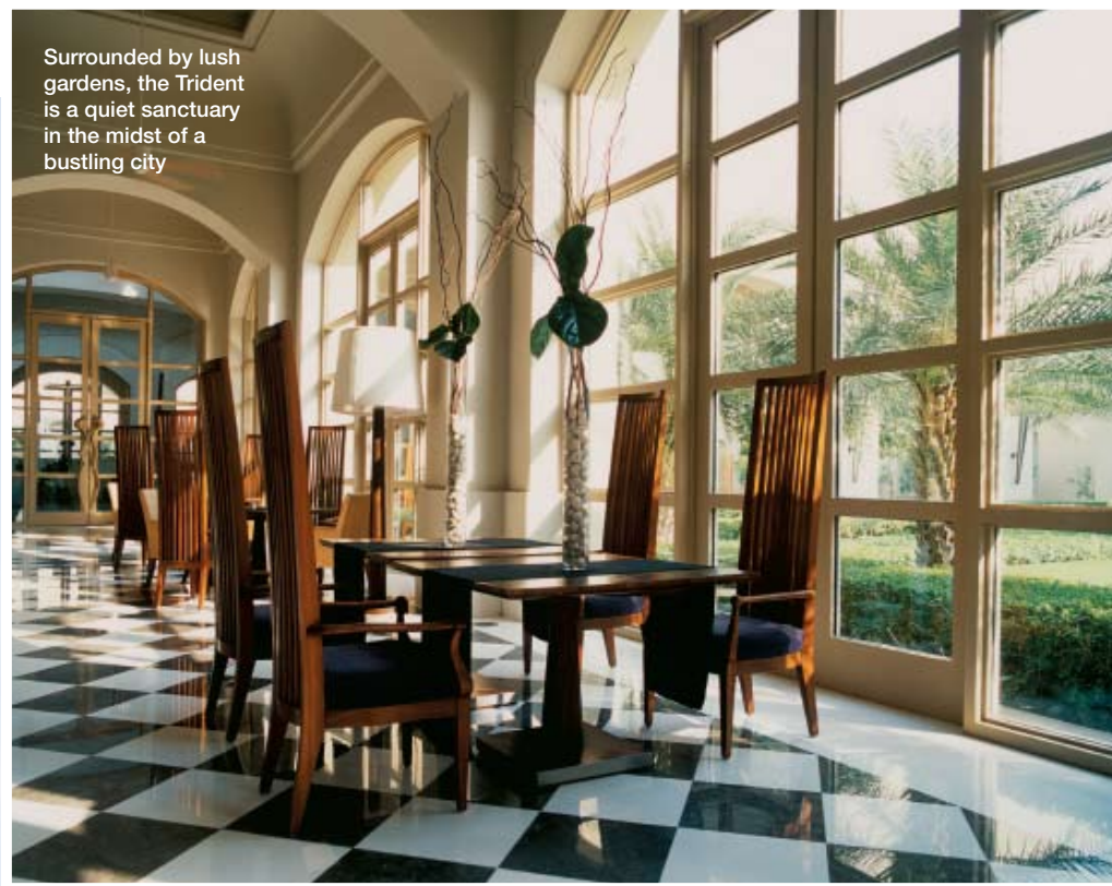
Surrounded by lush gardens, the Trident is a quiet sanctuary in the midst of a bustling city

Contact: Trident, India; tel: +91 124 245 0505; www.tridenthotels.com