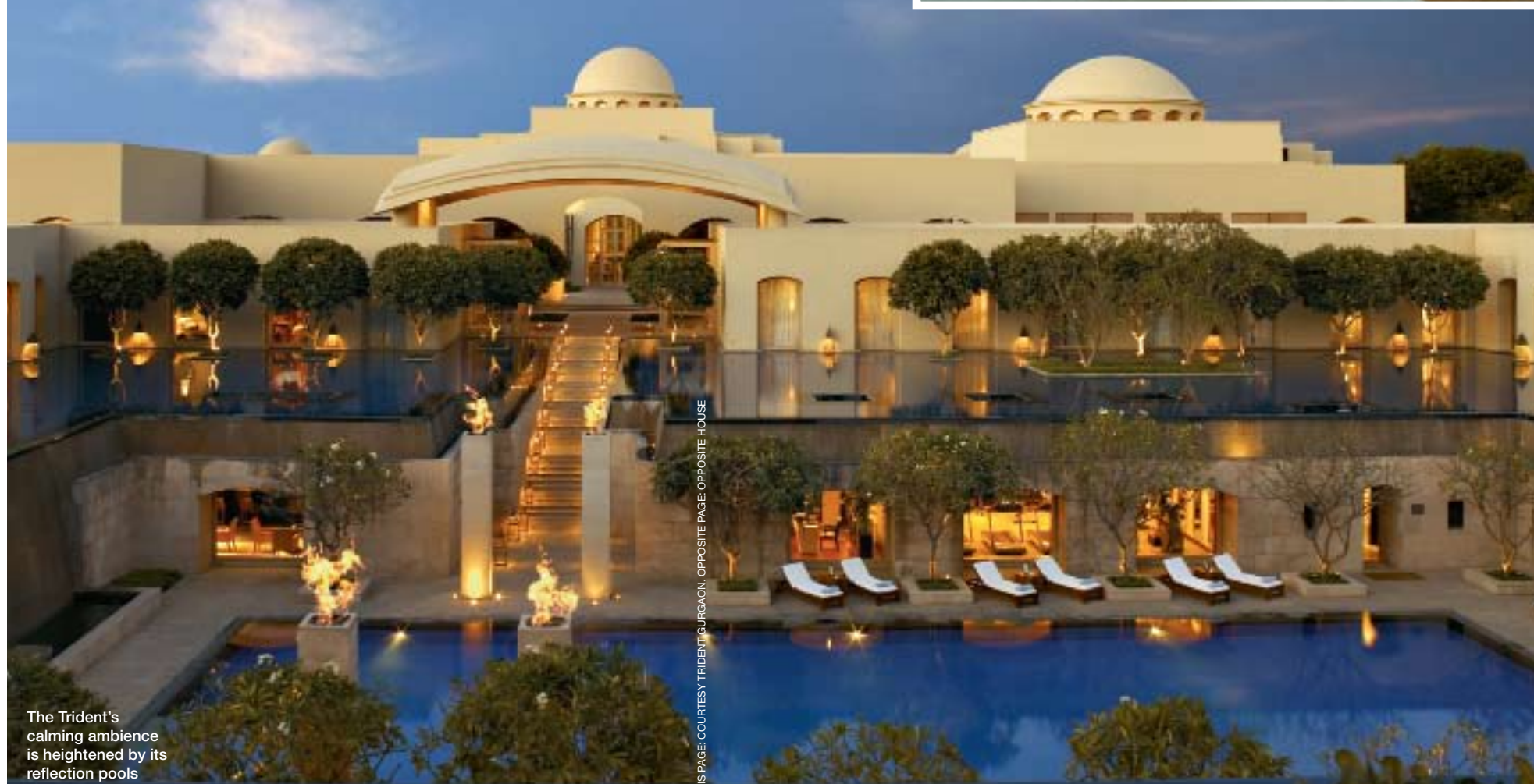
The Trident's calming ambience is heightened by its reflection pools

THIS PAGE: COURTESY TRIDENT GURGAON. OPPOSITE PAGE: OPPOSITE HOUSE