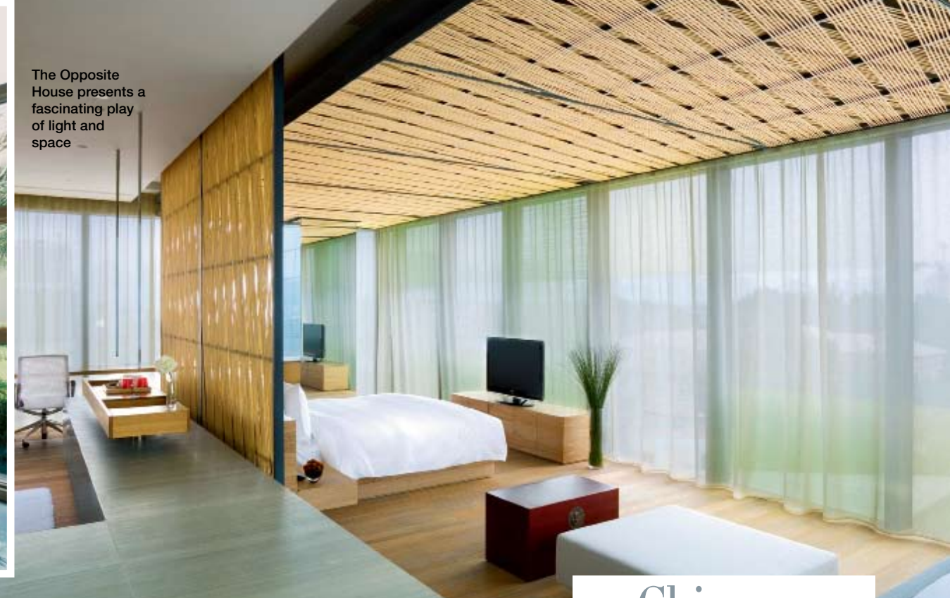
The Opposite House presents a fascinating play of light and space